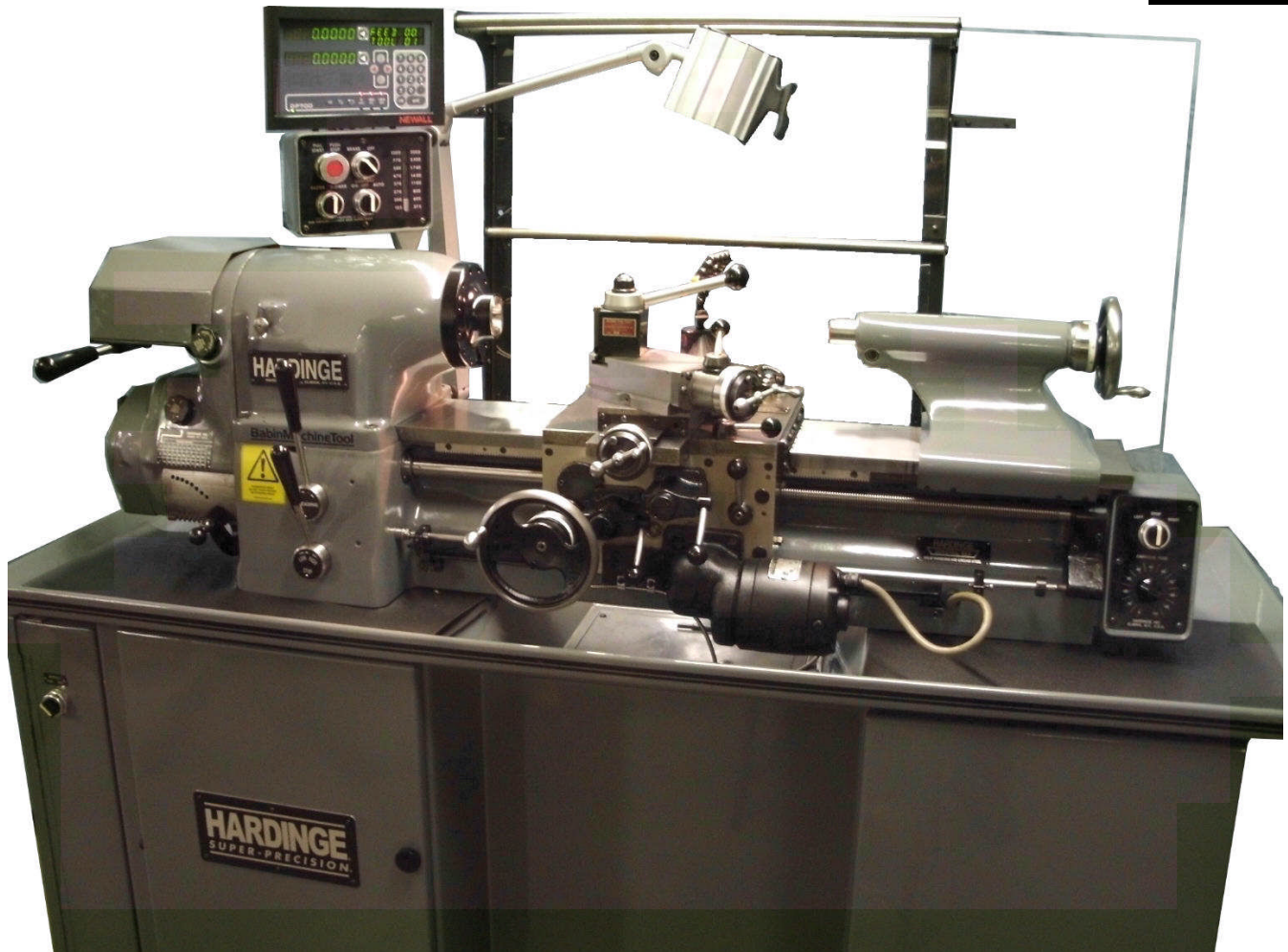
1979 HLV-H-toolroom lathe rebuilt with .0001"res Newall DP700 DRO